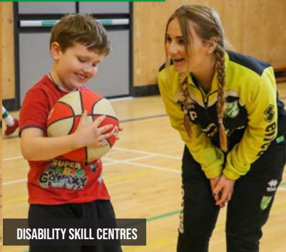
DISABILITY SKILL CENTRES