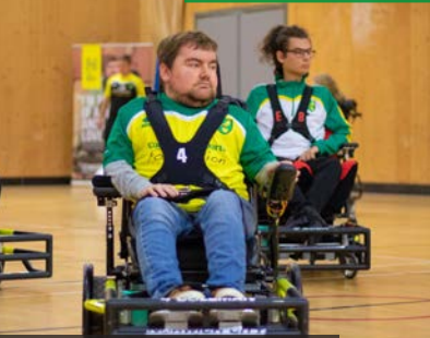
NORWICH CITY POWERCHAIR FOOTBALL CLUB