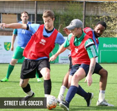
STREET LIFE SOCCER